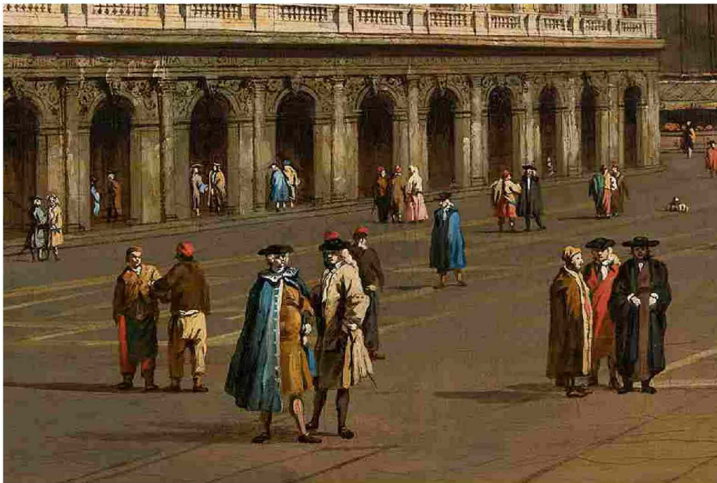
Canaletto, La Piazzetta (dottaglio), olio su tela, 1732-1738.